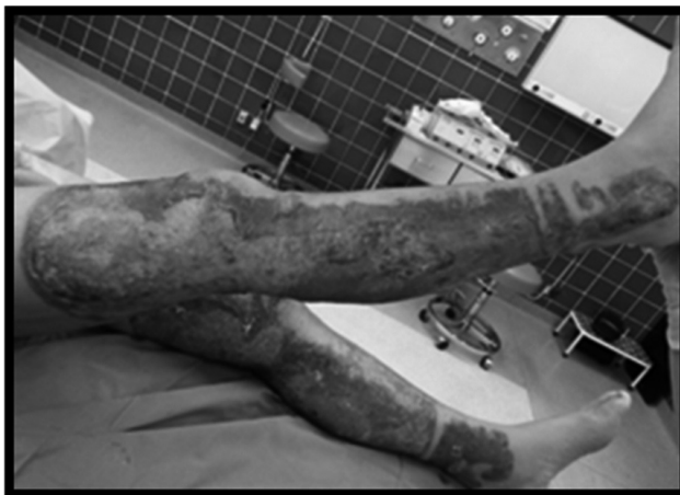
Fig. 1. Inveterate burn wounds to the lower limbs prior to the first surgical removal of necrotic tissue at MCOP in Cracow

In the course of treating the patient at MCOP a gradual removal of the necrotic wounds was carried out. The face was treated openly through the use of ointments enhancing necrotic wound debridement and the obtainment of correctly