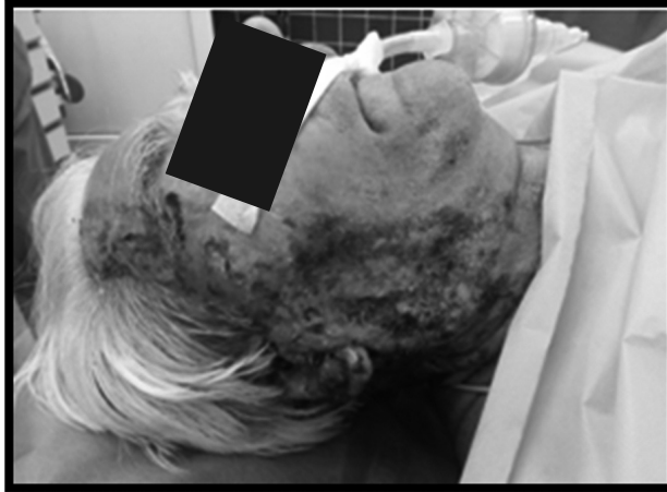
Fig. 2. inveterate burn wounds to the face and neck prior to the first surgical removal of necrotic tissue at MCOP in Cracow

controlled wound healing. All procedures on the burn wounds including dressing change were conducted in operating theatre conditions under general anesthesia or the use of analgesia (sedoanalgesia) providing a comfortable, painless treatment of a patient. This allowed the surgeons to perform radical treatment, whose aim was the rapid, yet safe for an elderly patient, excision of the necrosis and wound closure with a skin graft. The three stages of necrosis removal conducted were finalized by the covering of the lower limb burn wounds with mesh split thickness skin grafts with a mash ratio of 3:1. The final closure of the wounds by means of autologous skin grafts took place on the 11 th day following patient admittance. A satisfactory result of the healing process was achieved (Fig. 3)