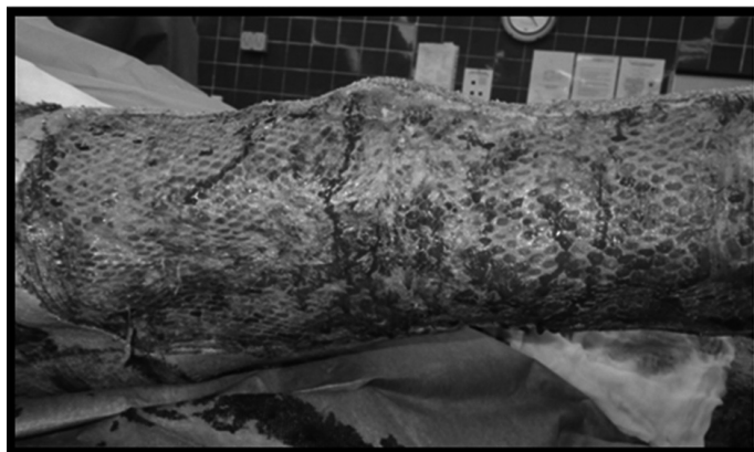
Fig. 3. The wound condition after the removal of the necrosis of the lower limbs and the closure of the wounds by the mesh skin graft with a mash ratio of 3:1 – in the course of the correct healing of the grafts

controlled wound healing. All procedures on the burn wounds including dressing change were conducted in operating theatre conditions under general anesthesia or the use of analgesia (sedoanalgesia) providing a comfortable, painless treatment of a patient. This allowed the surgeons to perform radical treatment, whose aim was the rapid, yet safe for an elderly patient, excision of the necrosis and wound closure with a skin graft. The three stages of necrosis removal conducted were finalized by the covering of the lower limb burn wounds with mesh split thickness skin grafts with a mash ratio of 3:1. The final closure of the wounds by means of autologous skin grafts took place on the 11 th day following patient admittance. A satisfactory result of the healing process was achieved (Fig. 3)