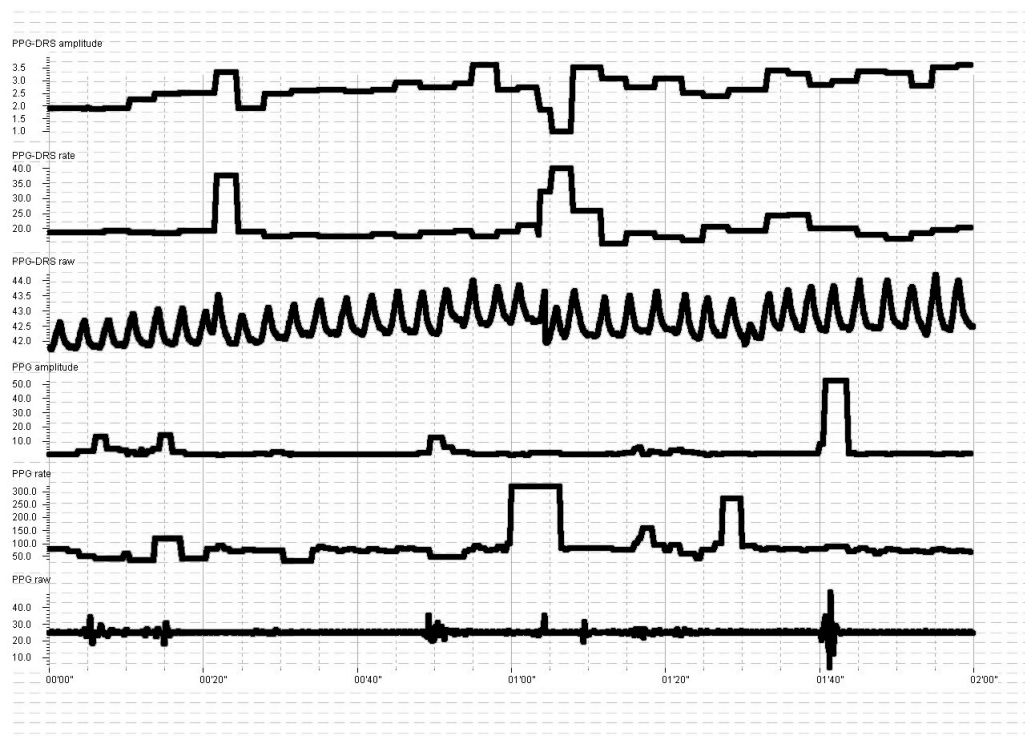
Fig. 2. Full analog plethysmographic signal digital record (counting from the bottom, in formats PPG raw, PPG rate and PPG amplitude as well as PPG-DRS raw, PPG-DRS rate and PPG-DRS amplitude) registered from the same patient (cf. Fig. 1)