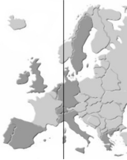
Figure 1. The map of Europe which the subjects had to imagine. Note that to the right of the meridian through Zurich (Switzerland) there are about three times as many countries as to the left